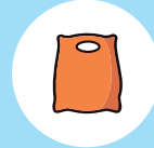
Plastic or paper bag you'd like to recycle