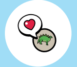
Any other decorations (optional)